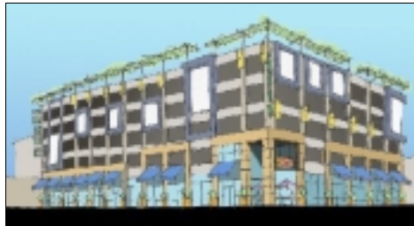
Rendering of the North Park Parking Garage