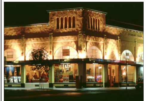
Claire de Lune – North Park's Business of the Year 2006

Claire de Lune also regularly contributes to events in the community. On the day of the North Park Festival of the Arts, Claire de Lune regularly donates coffee to the early morning volunteers. Claire de Lune has also donated meeting space for many community workshops, in addition to coffee. Now eight years later Claire de Lune competes in North Park against eight other coffee shops including two national chains.