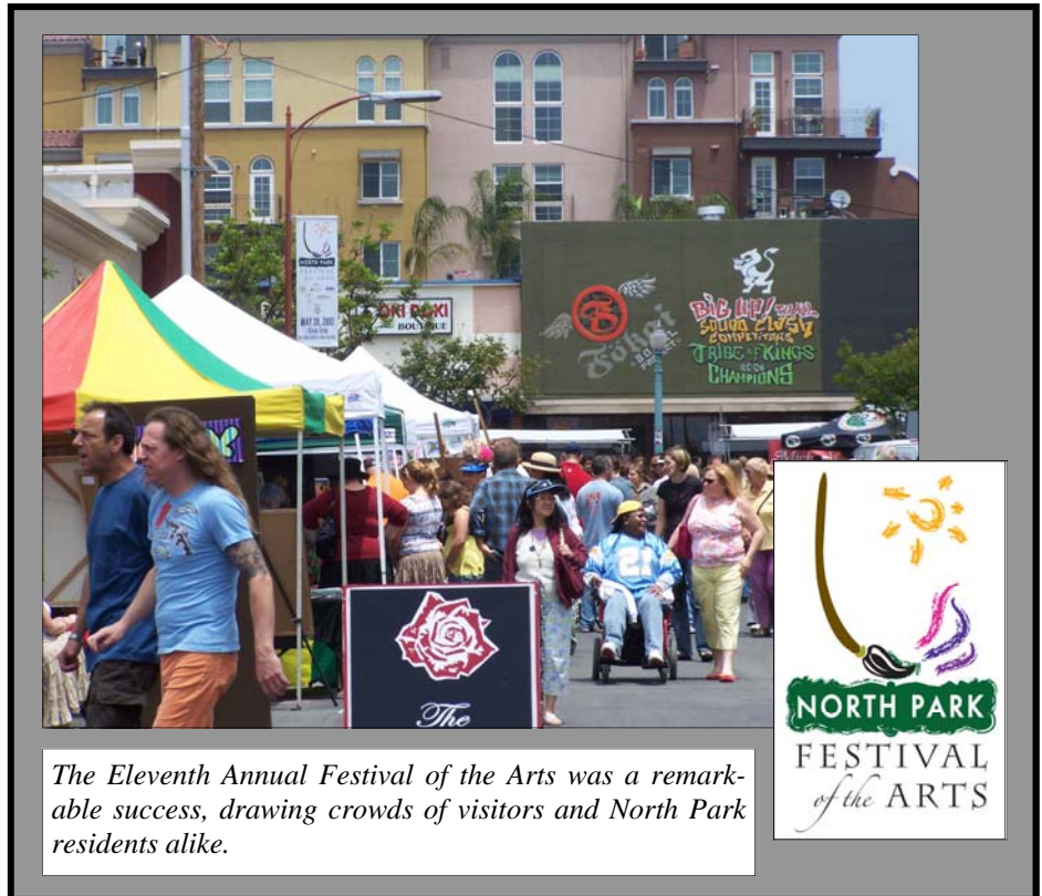
The Eleventh Annual Festival of the Arts was a remarkable success, drawing crowds of visitors and North Park residents alike.